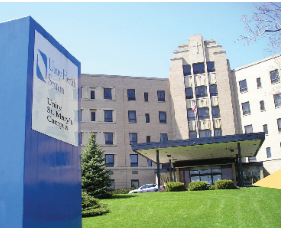
Unity St. Mary's Campus: A true multi-use facility, this health and human services center is the hub of numerous health and outreach services.